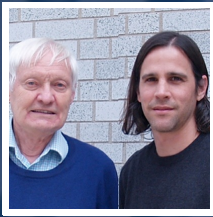
Joachim Frank Professor, Biochemistry and Molecular Biophysics