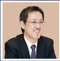
Yoshihiro Kawaoka Professor